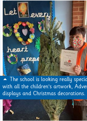
▲ The school is looking really special with all the children's artwork, Advent displays and Christmas decorations.