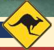
Goldfinches celebrated Australia