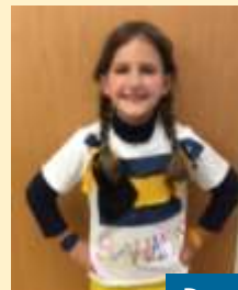
Doves celebrated the Bahamas