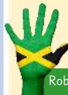
Robins celebrated Jamaica