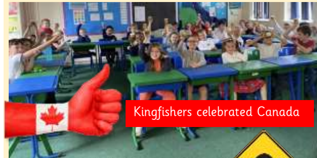
Kingfishers celebrated Canada

Throughout the week there has been an un-common wealth of colour as each class has celebrated a different Commonwealth country's heritage and traditions.