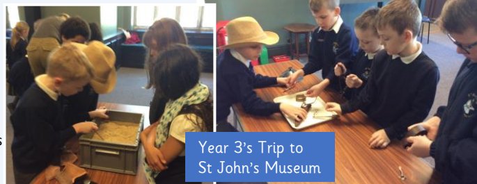
Year 3's Trip to St John's Museum