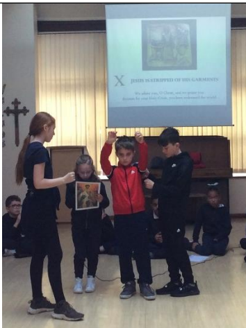
Tenth Station: Jesus is stripped of his clothes