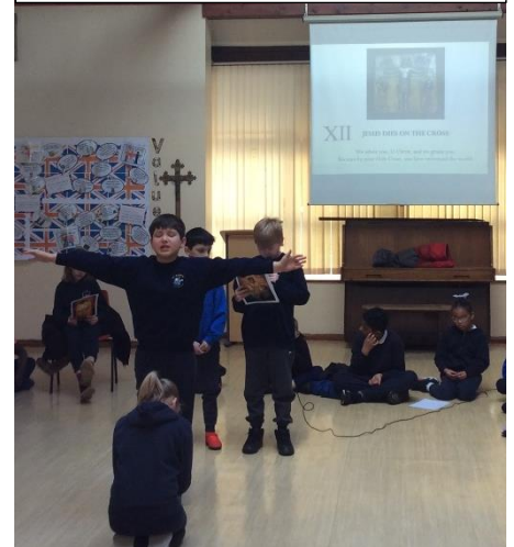
Twelfth Station: Jesus dies on the cross