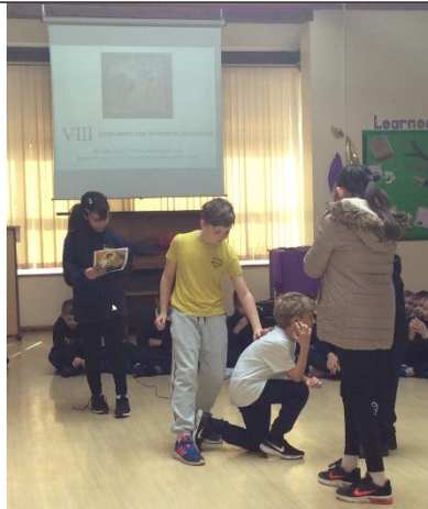
Eighth Station: Jesus meets the women of Jerusalem