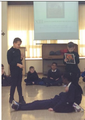
Thirteenth Station: Jesus is taken down from the Cross