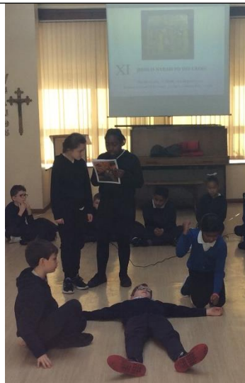
Eleventh Station: Jesus is nailed to the cross