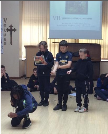
Seventh Station: Jesus falls for the second time