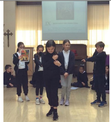
Ninth Station: Jesus falls for the third time