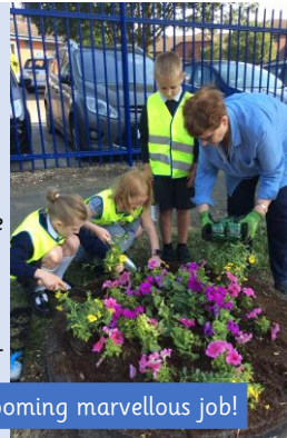
A blooming marvellous job!