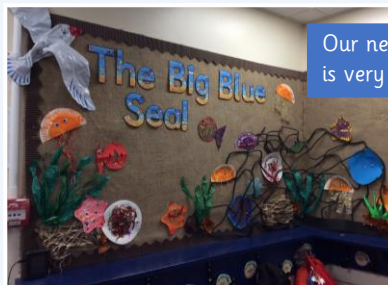
Our new EYFS Project is very messy fun!

This week we have started our new topic 'The Big Blue Sea'. The children are very excited and have enjoyed learning about sea creatures such as seahorse. The children have been very busy creating sea creatures using a variety of materials in the art area! We have made our own under the sea wall which is looking great. It has also been a very messy week in our class as the children explored sea foam!