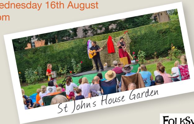
St John's House Garden